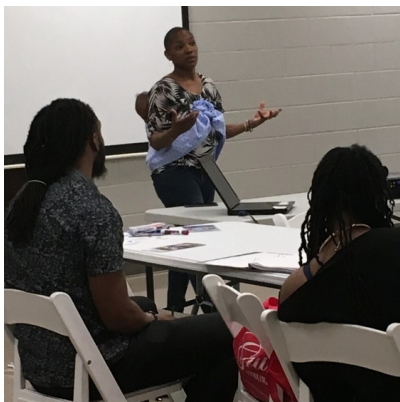
Members of the AWLN educate, organize and work to solve stormwater flooding issues in their communities.

During the AWLN training, participants learned about their watersheds, stormwater flooding issues and green infrastructure solutions. Members attended green infrastructure tours and community events that encouraged community participation in green space design and implementation.