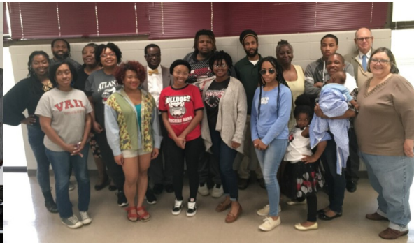
Community members participate in AWLN training workshops — 2017 Cohort (left) and 2018 Cohort (right).