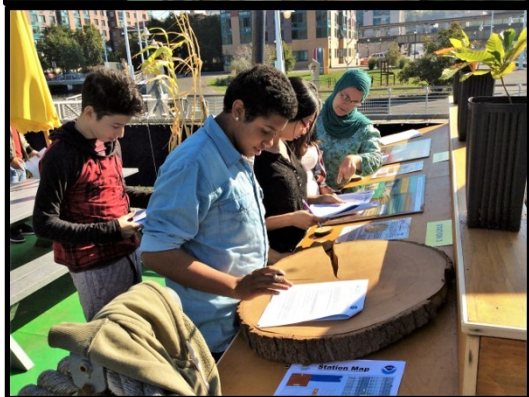
At the Science Barge, students examine water security around the world, identify vulnerable areas, and analyze tree ring data.

The curriculum starts with the big picture — global climate science. For the first field trip— Adapting to Global Impacts of Climate Change —students are introduced to the complex relationship between human behaviors and climate change. They visit the Science Barge – a completely off-grid, renewable energy-supported greenhouse operated by Groundwork Hudson Valley and docked in downtown Yonkers—to ask important questions like: “What is climate?” and “What are the impacts of a changing climate?”