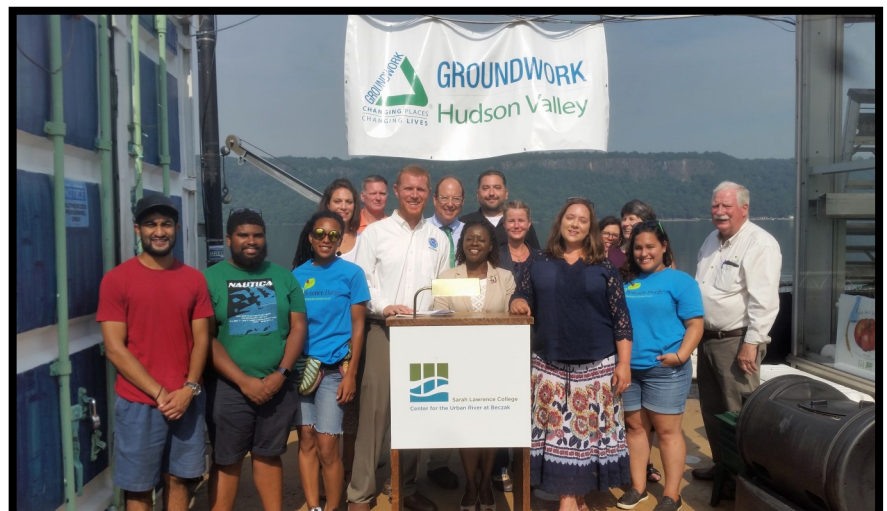
Representatives from NOAA visit the Science Barge.