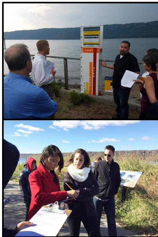
At CURB, students learn about the Hudson River, recent storm surges, and the function of coastal wetlands.

At CURB, the students use both indoor and outdoor installations to learn about Hudson River geography and history, paying close attention to storm events. They examine sea level rise, the functions of wetlands, and the impacts of ocean acidification through videos, interactive computer maps, and on-the-ground examination of storm surge levels in the tidal marsh. Students obtain a firm grasp on the impacts of climate change in the Hudson River Valley, where they live and experience the changes.