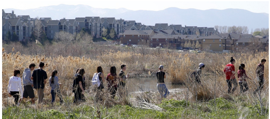
Jordan High School students enter Sandy, Utah, restoration site during CDEA

Though the ReAwakened Beauty project was a two year, grant-funded project, the outcomes are significant. Salt Lake County, the Jordan River Commission, and the Center for Documentary Expression and Art worked collaboratively to achieve a truly impactful education and stewardship program. Youth explored and restored portions of the Jordan River, discovered and communicated their relationship to the river, and provided content for the JRC Mobile Website. In addition, the Rose Park community and greater Salt Lake County as a whole now have access to resources and activities related to the river.