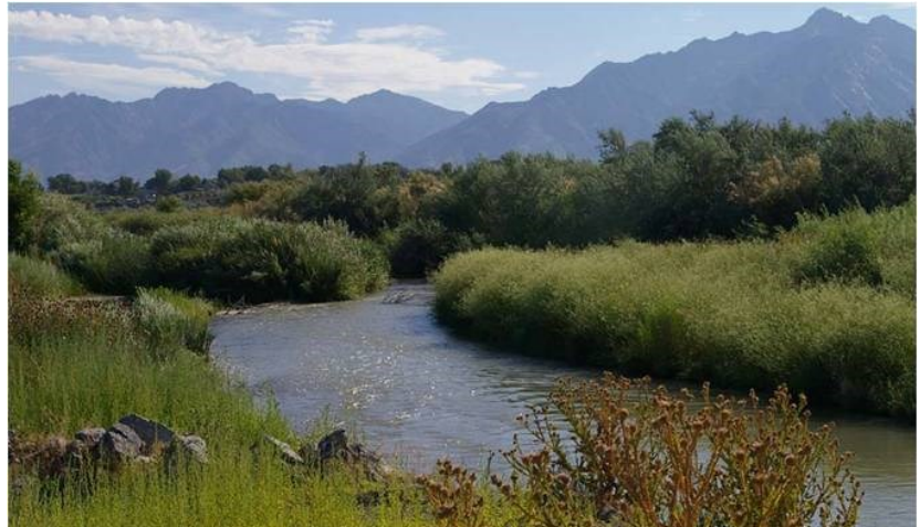
Jordan River. Salt Lake County, UT.

The Jordan River is about fifty miles long. Beginning at Utah Lake, the river flows through the Salt Lake Valley and empties into the Great Salt Lake. Between the 1800s and 1980s, the river was an industrial dumping ground that attracted drug users and other undesirable behavior. As is the case with many urban rivers, Superfund and Brownfield sites exist up and down the banks of the river. In recent history, the Jordan River has been seen by residents, particularly youth, as a place where “you just don’t go.” There hasn’t been much positive activity along the river due to contamination issues and related challenges.