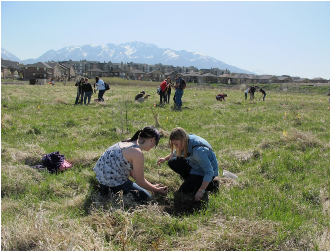
Jordan High School students plant Willows and Cottonwood saplings during CDEA residency.