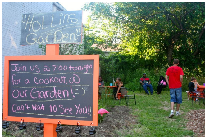
Below: Hollins Rain Forest community green space. Another winner of the Growing Green Design Competition.