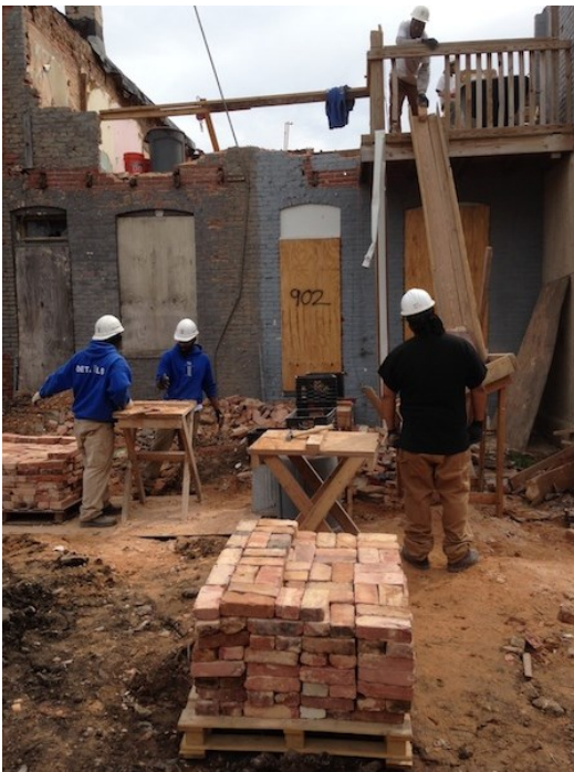
Employees with DETAILS manage materials at a job site in Baltimore.