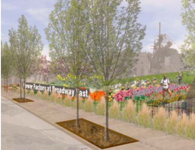
Above: Proposed green space design from The Flower Factory, a winner of the Growing Green Design Competition.