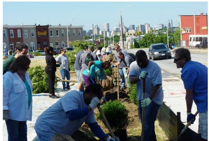
New Broadway East Community Park. Built in place of dilapidated row houses.

Parks & People engages communities in the creation of green spaces on formerly abandoned lots. They focus on removing impermeable surfaces, creating rain gardens, creating edible gardens, and helping install green infrastructure improvements.